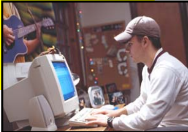
Virtual on-line classroom