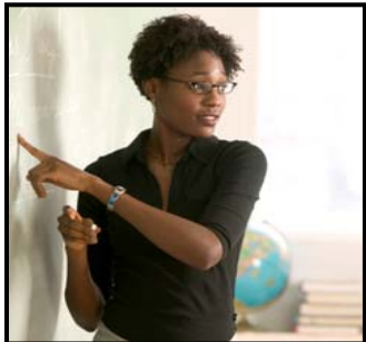
Public School or private Classroom instruction